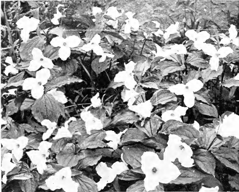
Trillium grandiflorum. See page 9

Including Trilliums, Liliiums, Iris, Dicentra, Galax, Phlox, Sedum, Shortia, Cypripediums, and Many Others